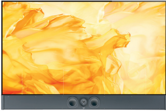
Décor 1C Center