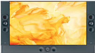
Décor 2S / 1C Stereo + Center