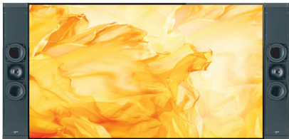
Décor 2S Stereo