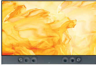
Décor 1S Stereo