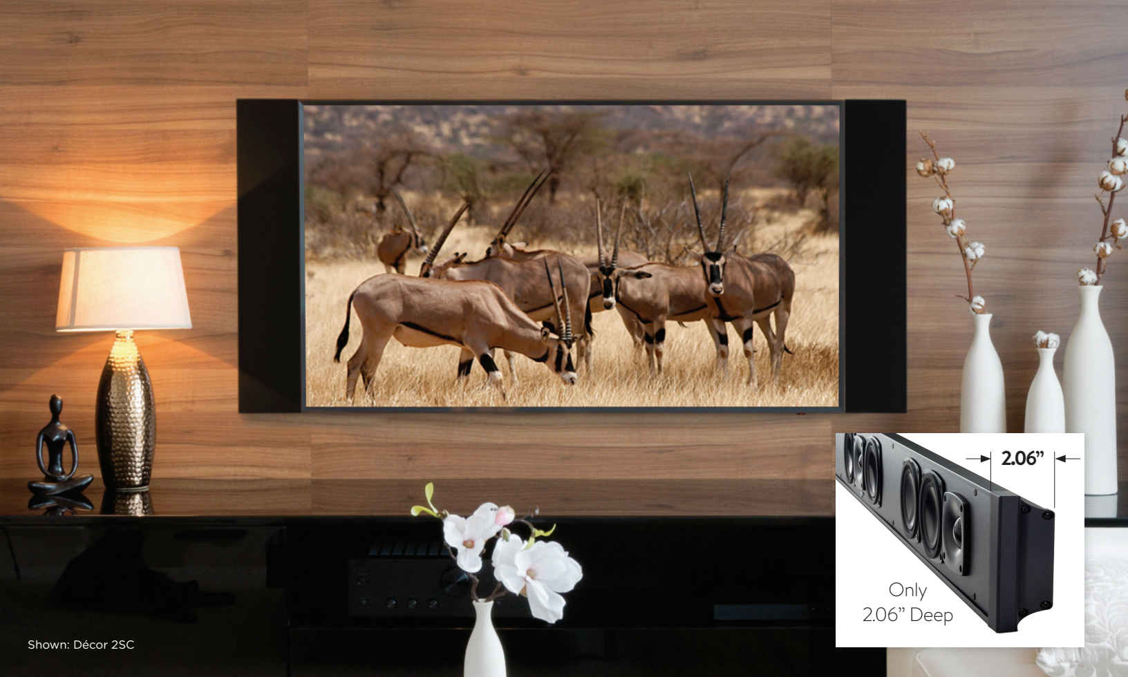
Shown: Décor 2SC