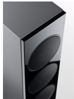
Glass black front