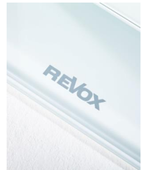
Logo on white glass foot