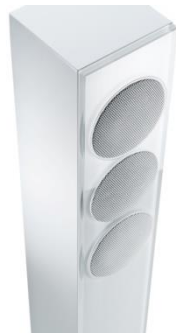
Glass white front