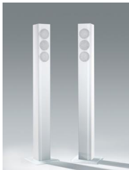
Column G70 white

The elegant column speaker combines slenderness with the highest audio quality, perfectly. No compromises were made on sound during the development: D'Appolito chassis assignment for symmetrical emissions and bass reflex support for a broad frequency range, are just two of the excellent qualities of the Column G70.