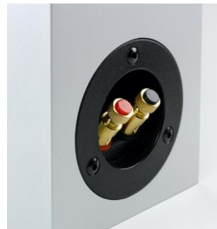
Shelf G70 terminals