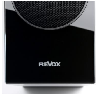
Shelf G70 logo