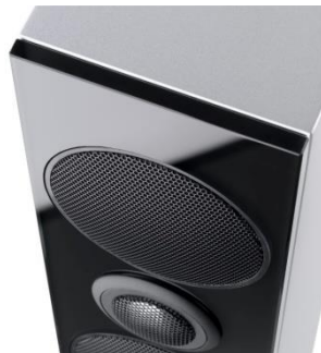
Shelf G70 front of glass