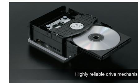
Highly reliable drive mechanism

The D-380 features a left sided mechanism layout to accommodate the ideal flow for the sound signal and power supply as proven in the D series of SACD players. A new mechanical design has resulted in an 8mm thick solid aluminium base with a loopless and shielded box chassis to provide support for the drive mechanism and stability in reading the digital signal.