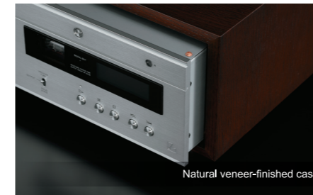
Natural veneer-finished case

The elegant exterior of the D-380 is housed in a full sized wooden box (440mm in width) with a natural veneer finish and a stylish hairlined surface on the front panel. When used together with the similarly housed LUXMAN amplifiers such as the LX-380 vacuum tube integrated amplifier, the effect is pleasing.