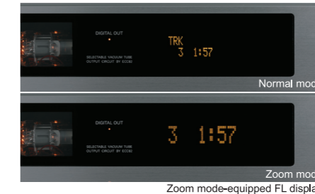
Zoom mode-equipped FL display

The D-380 features a large, high quality, high visibility FL display with 4x zoom mode – a useful tool for remote operation from a listening position at distance from the system. The orange colour of the display takes into consideration the illumination environment of a listening room, whilst a dimmer (illumination switching) function can turn the display light off completely.