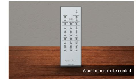
Aluminum remote control

A stylish aluminium remote control is supplied with the D-380 enabling comfortable operation of the system from any listening position. The remote control allows the user to perform necessary functions such as the choice of various playback options. The articulator mode is also available by holding down the CLEAR button to refresh the sound quality by demagnetizing the output transformer of the vacuum tube circuit.