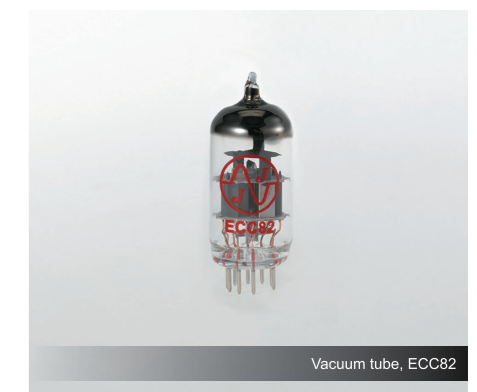
Vacuum tube, ECC82

The D-380 has been designed to be durable with sufficient margin built in for the operating voltage and the heat radiation of the vacuum tube.