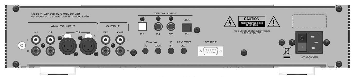
Figure 2: Neo 430HA Rear panel

The rear panel will look similar to Figure 2 (above). There are two (2) pairs of single-ended analog inputs on RCA connectors labeled "A1" and "A2" followed by one (1) pair of balanced analog inputs on XLR connectors labeled "B1". The RCA input and output connectors on the rear panel have been color coded: 'white' for the left channel and 'red' for the right channel.