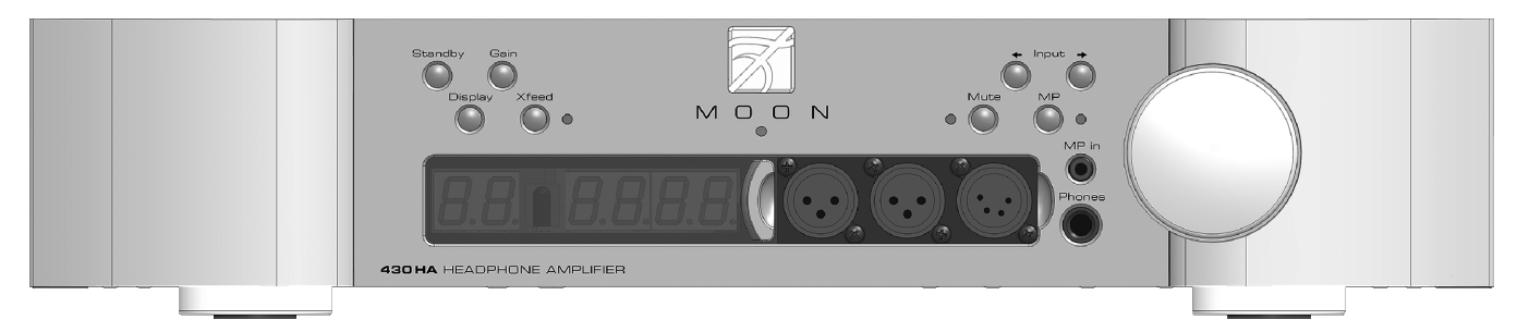
Figure 1: Neo 430HA Front panel

The front panel will look similar to Figure 1 (above). The large display window indicates the selected input and volume level setting. If your Nēo 430HA includes the Digital-to-Analog converter (DAC) option, the digital input signal's sampling rate will briefly appear in the display window. Refer to the section entitled "Optional Digital Inputs" on page 10 for further details.