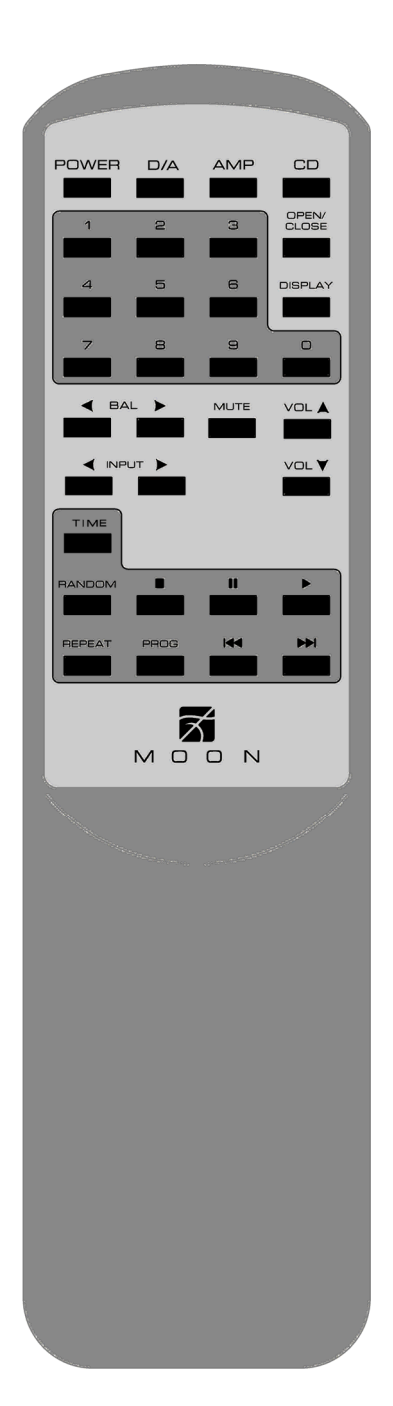
Figure 3: CRM-2 Remote Control

The Nēo 430HA Headphone Amplifier uses the 'CRM-2' full-function remote control (figure 3). It operates on the Philips RC-5 communication protocol and can be used with other Simaudio MOON components.