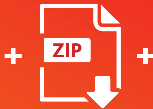
ARC® Genesis Software (free download)