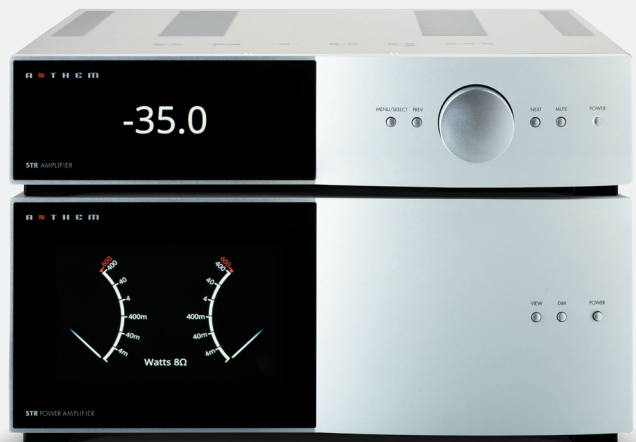
STR Preamplifier pictured with STR Power Amplifier (sold separately). Both models available in black or silver finishes.