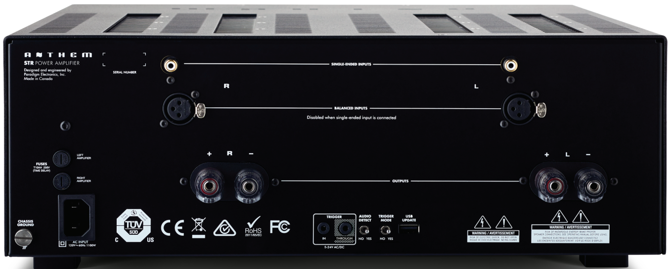
STR Power Amplifier Rear Panel